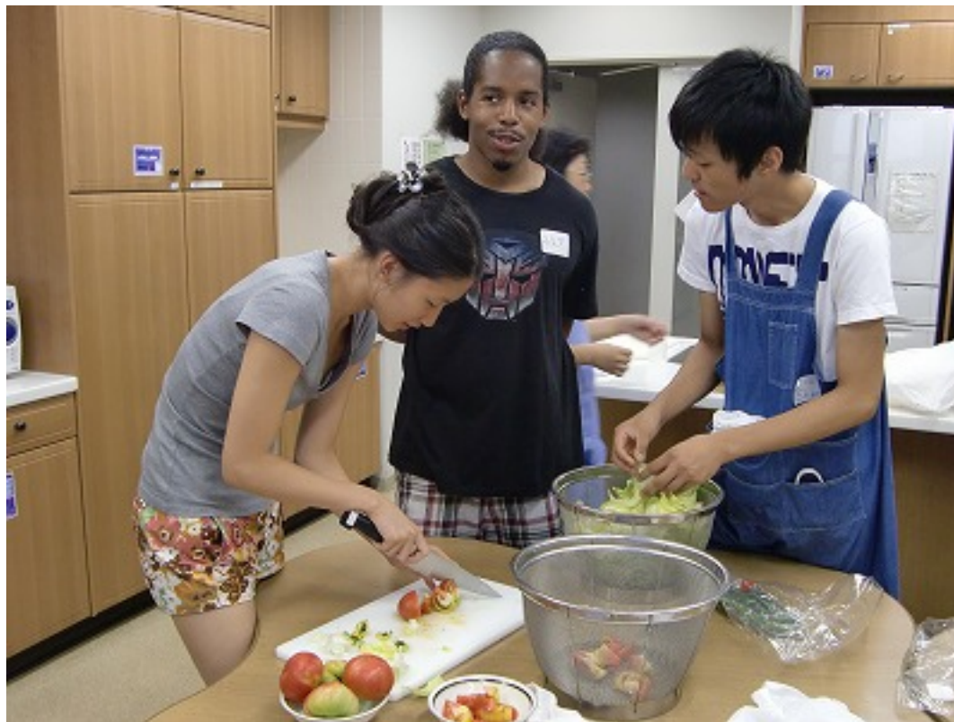
More vegetable cutting. Apples and cabbage are going into this pot.