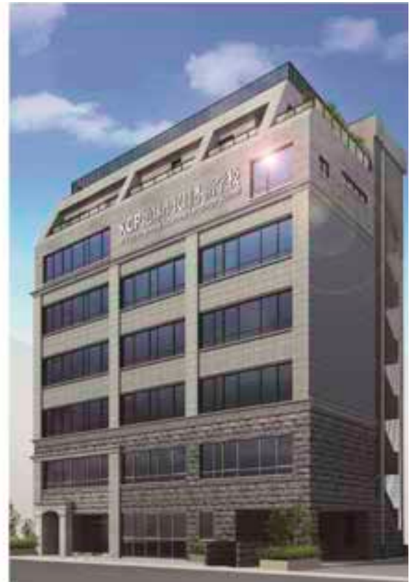
KCP Campus in the heart of Tokyo