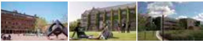
Western Washington University

These universities grant academic credit to students enrolled at them and can also grant transfer academic credit to students from other colleges who apply to the KCP program through them.