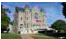
Virginia Union University