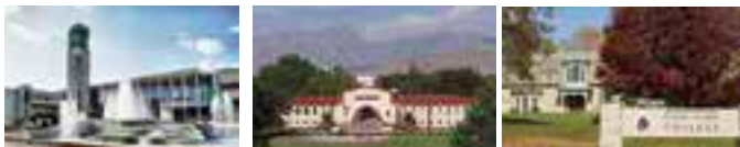
Missouri State University